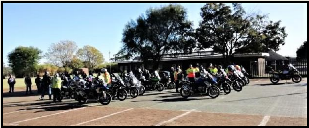
Line-up for the 2-Dam biker outride for the Saturday