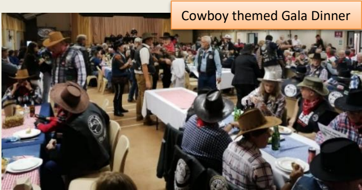
Cowboy themed Gala Dinner